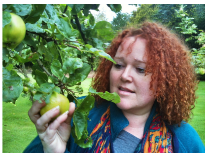
Apples, plums and blackberries used in this week's dishes were 'foraged' locally last weekend!

"Take your time to enjoy your meal... We only have one sitting so relax, unwind and savour great cuisine."